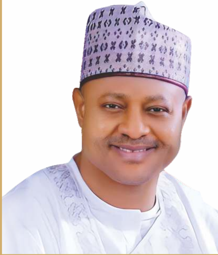
HIS EXCELLENCY SEN. (DR) UBA SANI THE GOVERNOR, KADUNA STATE AND VISITOR TO KADUNA STATE UNIVERSITY