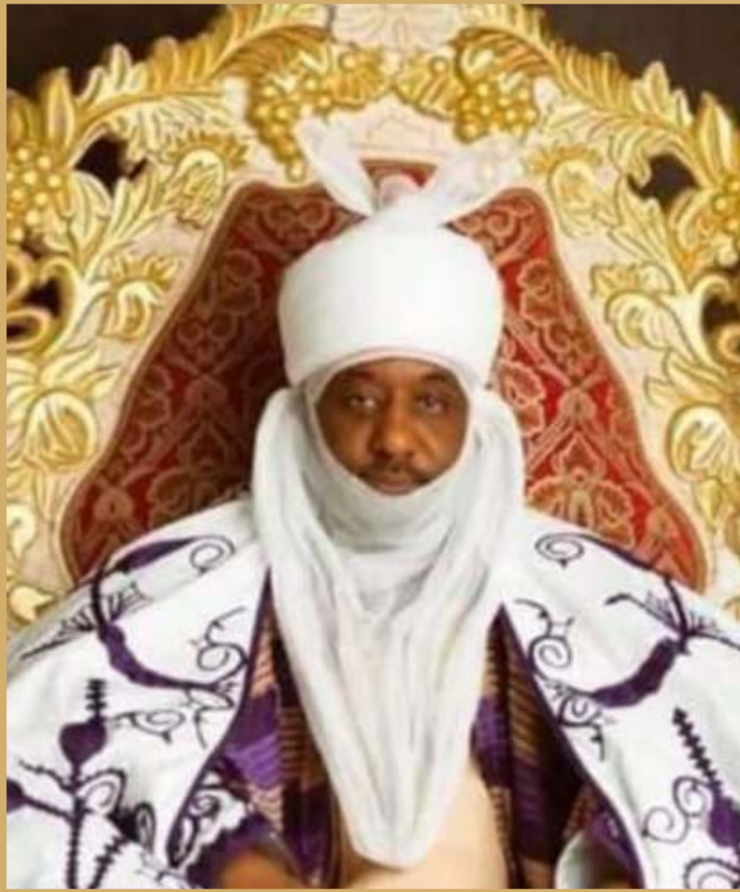
HRH SANUSI LAMIDO SANUSI CHANCELLOR KADUNA STATE UNIVERSITY