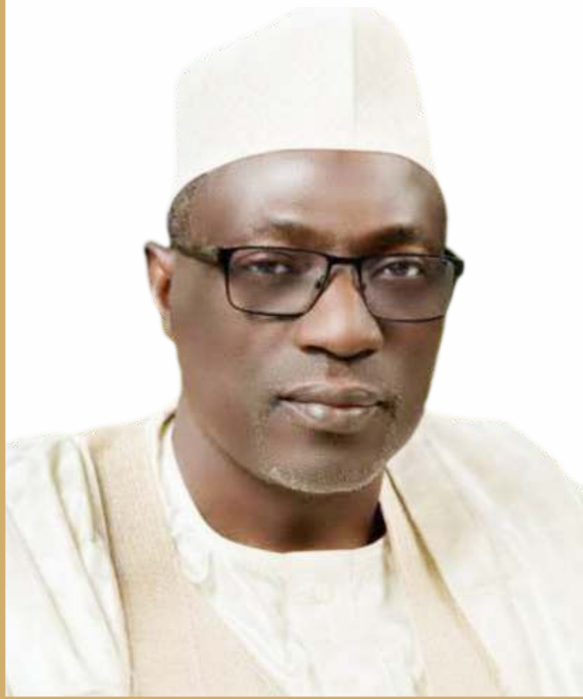
SPECIAL GUEST OF HONOUR SEN. AHMED MUHAMMED MAKARFI, CON FORMER GOVERNOR OF KADUNA STATE