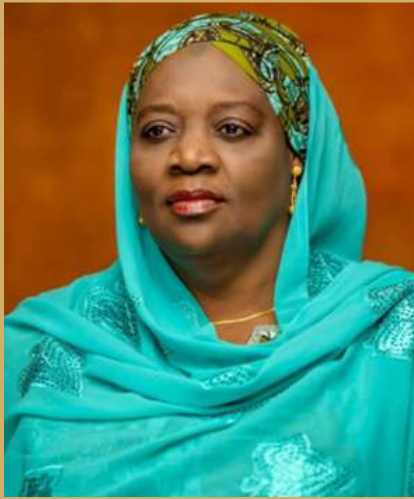
HAJIYA UMMA K. AHMED HONOURABLE COMMISSIONER OF HEALTH, KADUNA STATE