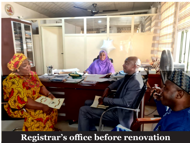
Registrar's office before renovation