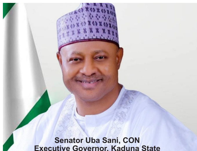
Senator Uba Sani, CON Executive Governor, Kaduna State

facelift of the Registrar's office. He reaffirmed the university's commitment to advancing research initiatives capable of contributing directly to the socio-economic development of Kaduna State and Nigeria at large.