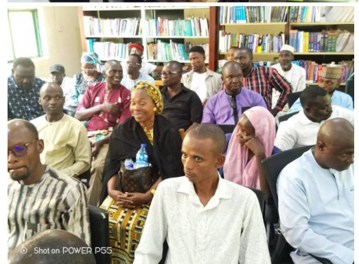
Shot on POWER P55