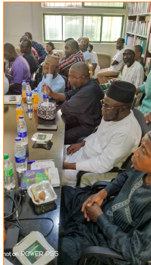
Shot on POWER P55

disciplines, including Economics, Political Science, Sociology, History, and Business & Public Administration. Their interdisciplinary participation fostered robust academic discourse and critical analysis of colonial taxation systems and their contemporary implications.