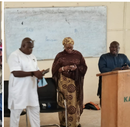
Joint Action Committee (JAC) of the Senior Staff Association of Nigerian Universities (SSANU) and the Non-Academic Staff Union of Universities (NASU) at Kaduna State University