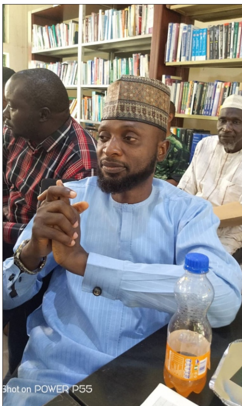
Shot on POWER P55

The seminar was widely regarded as intellectually stimulating and impactful, further reinforcing the university's commitment to academic excellence and policy-relevant research.