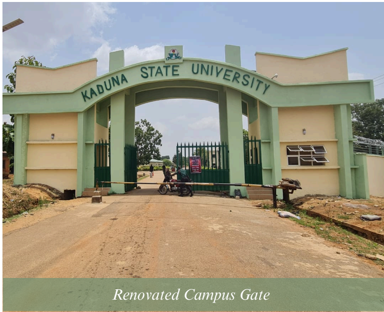
Renovated Campus Gate