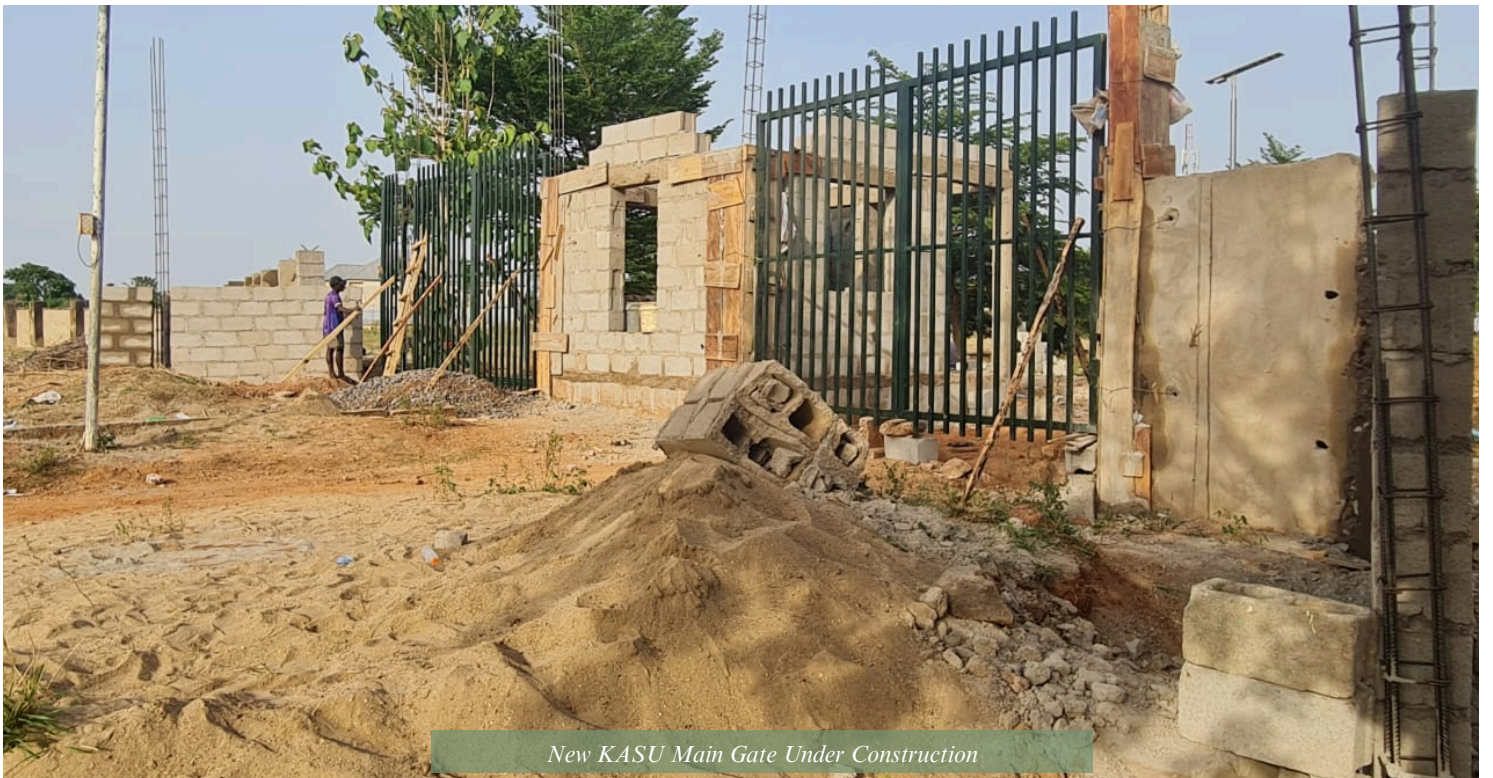
New KASU Main Gate Under Construction