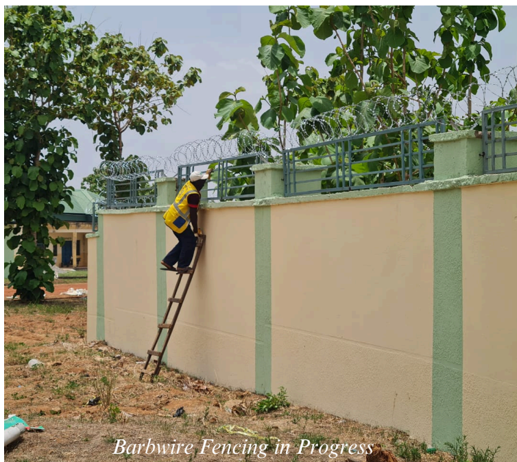
Barbwire Fencing in Progress