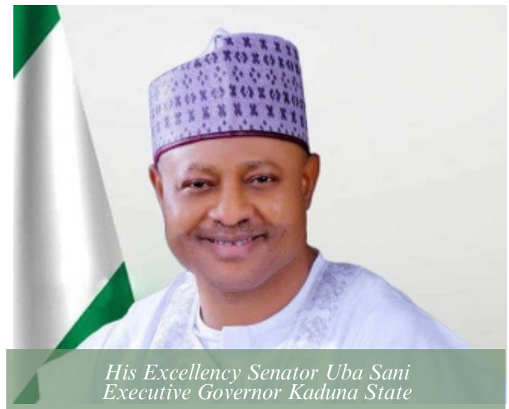
His Excellency Senator Uba Sani Executive Governor Kaduna State

The scope of work covers key infrastructural improvements across the campus, including the renovation of classrooms to enhance teaching and learning conditions, upgrade of student hostels to improve accommodation standards, provision of street light as well as general site works to improve accessibility, functionality, and aesthetics.