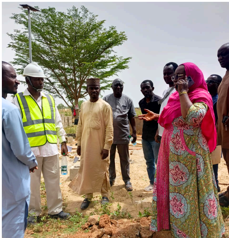
Administrator KASU-Kafanchan Campus with stakeholders on inspection of work

As work progresses steadily, many within the university community remain appreciative of the governor's intervention, seeing it as another practical step toward strengthening Kaduna State's educational future.