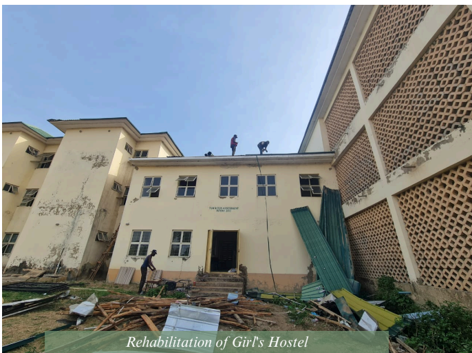
Rehabilitation of Girl's Hostel